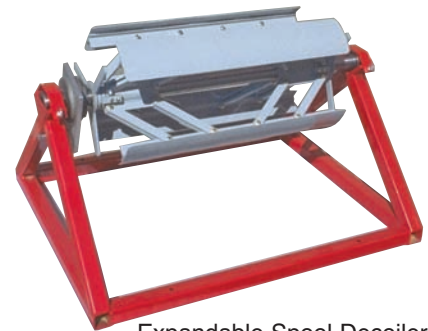
Expandable Spool Decoiler

Form Both 12" & 16" Wide Panels 304 Stainless Steel Tooling Industrial Grade Hydraulic System Notching Hydraulic Shear For Easy Assembly 4,000 lb. Capacity Expandable Decoiler With Brake & Stand Stiffening Ribs Limit Switch Measuring Device Hand Held Remote Controls