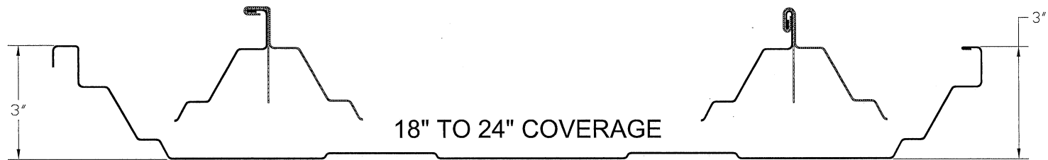
MODEL TSS-3000B 3" TRAPEZOIDAL STANDING SEAM